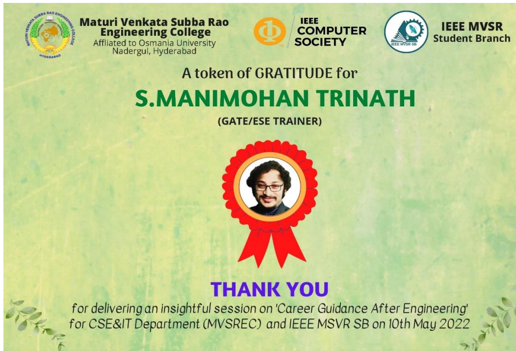
Virtual Memento given to the speaker

Lastly, the speaker explained about various PSUs which exist in India and provide various career opportunities for Computer Science and Engineering students across India.